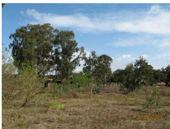
Bayside 20 Bed CCU Site