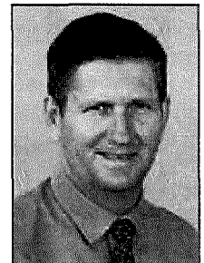
Lawrence Springborg Minister for Health

I encourage all Queenslanders to support its implementation to achieve a better future for us all.