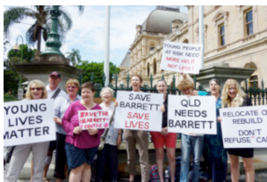
Image linked to 'Email the Politicians' form set up via CommunityRun)

It is in our numbers that we can make a difference. But we must act now. Before it is too late.